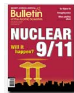
Table of Contents Subscribe Online Newsstand Locator